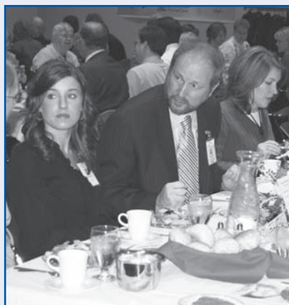
St. Alexius staff attends the Bishop's liturgy and luncheon.

We heartily thank you for your support as we continue offering mission and values programs to the various boards and personnel who serve at our institutions.