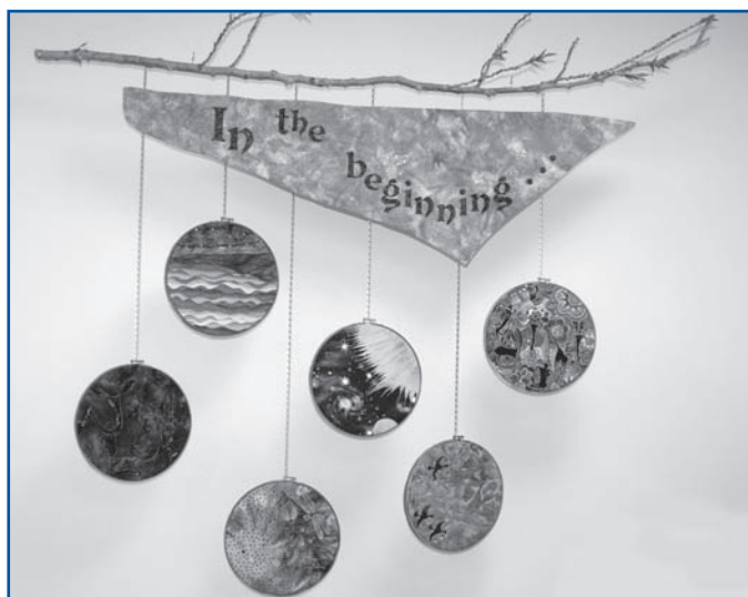
"Six Days of Creation"